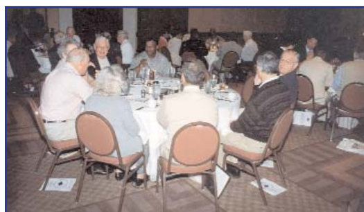
Fun and Fellowship