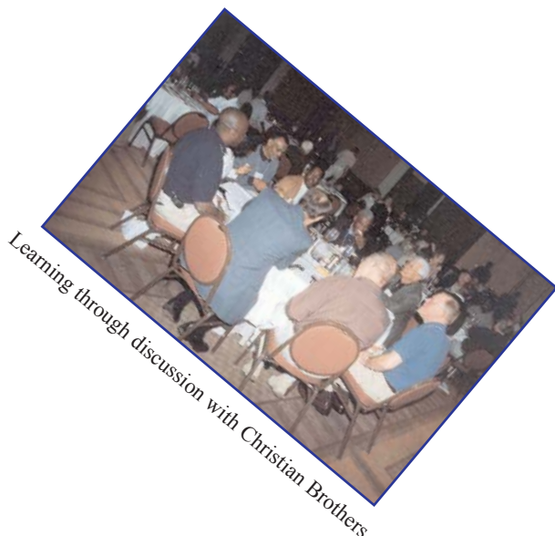
Learning through discussion with Christian Brothers