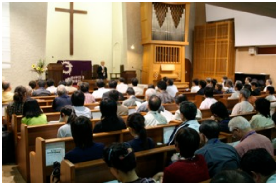
Plenary Session in Okayama Church

The conference ended with a plenary session where participants freely shared their thoughts and opinions on how the BLC should move forward and was followed by the closing worship service. The entire program was one that fostered renewed friendships and fellowship. One thing, however, that I was disappointed with is that none of the Kyōdan executive leadership were present. I certainly hope that I can see at least some of them at the next conference.