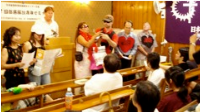
Skit presented by group visiting from Hollywood Presbyterian Church

The 11 th annual Buraku Liberation Youth Seminar was held from August 5-8 at the Izumi Church in Ōsaka. A total of 74 persons participated for at least part of the period, with participants ranging from Hokkaidō to Kyūshū, and even including a delegation from the US who spent a day with us.