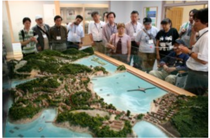
Participants view model of Nagashima facilities

The Japanese government website lists a total of 13 such sanatoriums around the country, with the latest figures for the number of residents being