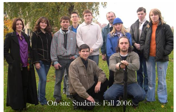
On-site Students. Fall 2006.

New life in the church appears when young people begin their service as church leaders. In five congregations, then, there were signs of new life as our seminarians began their internships in September in October.