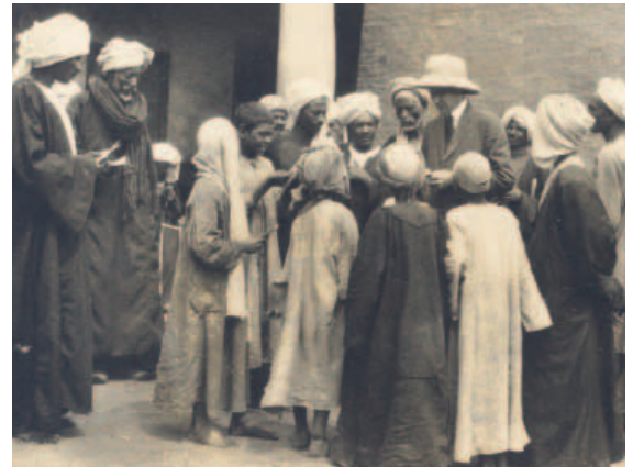
A Presbyterian missionary at work in Egypt, distributing tracts, circa 1920. UPCNA Egypt Mission.

united in 1983, their mission boards were combined five years later under the name Global Mission Ministry Unit. In 1993 this became the Worldwide Ministries Division, which eventually became simply Presbyterian World Mission.