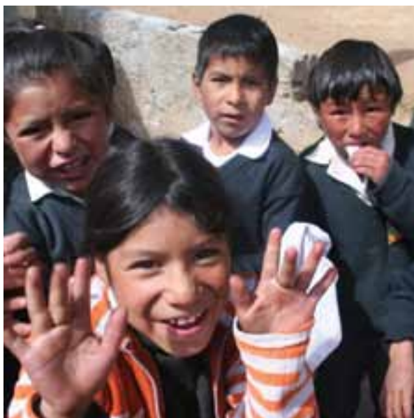
Peruvian children are at risk due to lead poisoning from environmental practices.

Mission Yearbook for Prayer & Study , a book of daily prayers, stories and mission information, published annually: www.pcusa.org/missionyearbook . To order, call (800) 524-2612 and request item #978-1-57153-092-9.