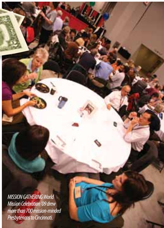
MISSION GATHERING World Mission Celebration '09 drew more than 700 mission-minded Presbyterians to Cincinnati.