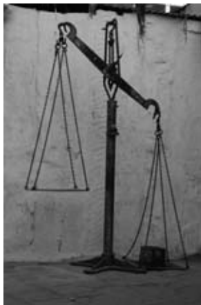
Acts of Discernment

Permission is granted to reproduce material in this issue with the exception of copy-righted material. Please acknowledge the source. Unsolicited manuscripts are welcome.