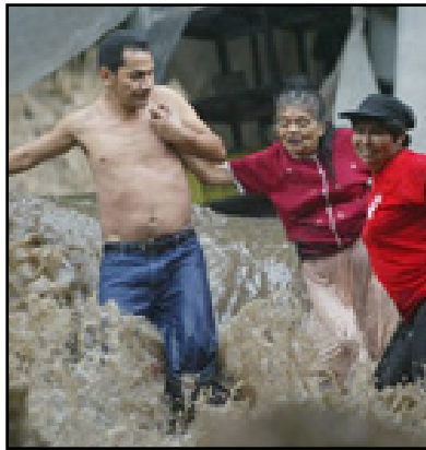
Hurricane Stan has left many people seeking safety.