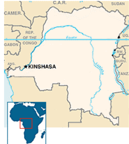
Democratic Rep. of Congo

American Presbyterian mission involvement in the Democratic Republic of Congo (DR Congo, formerly Zaire) dates back to 1891 and has been a catalyst for the formation of numerous thriving ministries, including two autonomous, vibrant churches: the Presbyterian Community of Kinshasa (CPK) in 1955 and the Presbyterian Community of Congo in 1961. All of the PC(USA)'s partnerships in Congo are rooted in our relations with these two denominations.