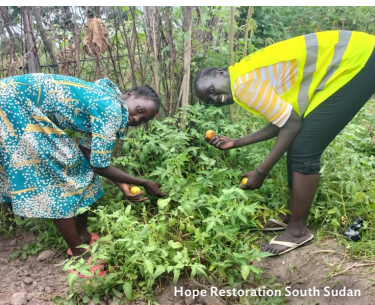
Hope Restoration South Sudan