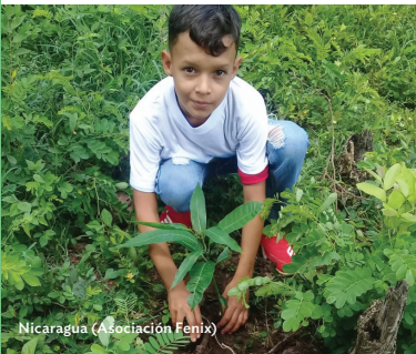
Nicaragua (Asociación Fenix)